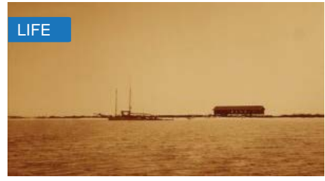
The Beloved Mississippi Island